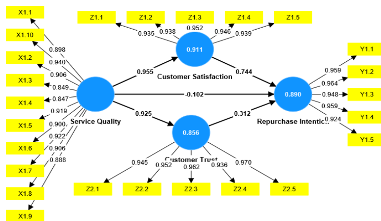
Figure 2 Structural Model

Inner models can be said to be structural models that are Commonly employed for forecasting cause-and-effect associations between variables that cannot be directly quantified and hidden variables.