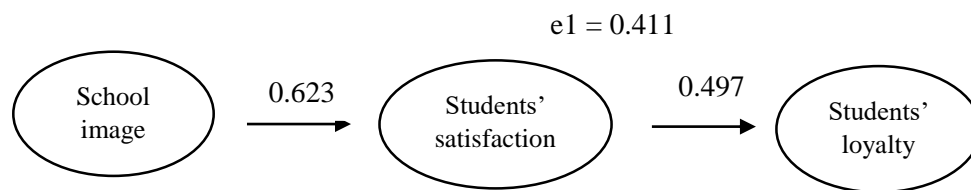
Figure 2. The Direct and Indirect Effect to Loyalty